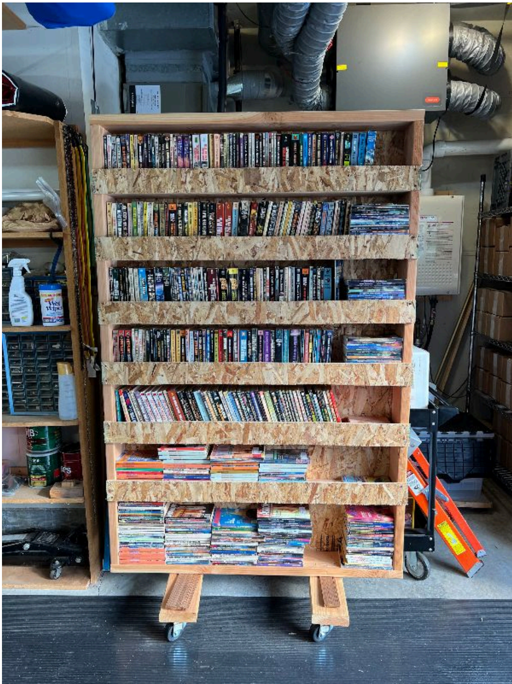
Mass market paperbacks, anyone?