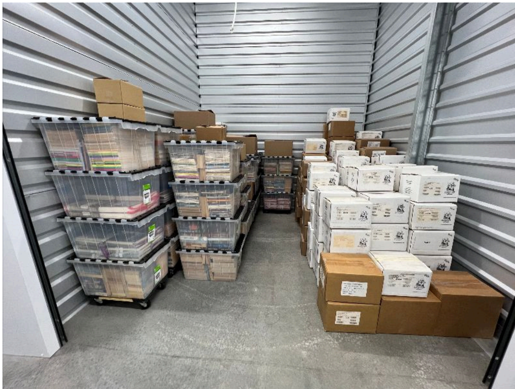
Here's where we store books we're not quite ready to ship yet.