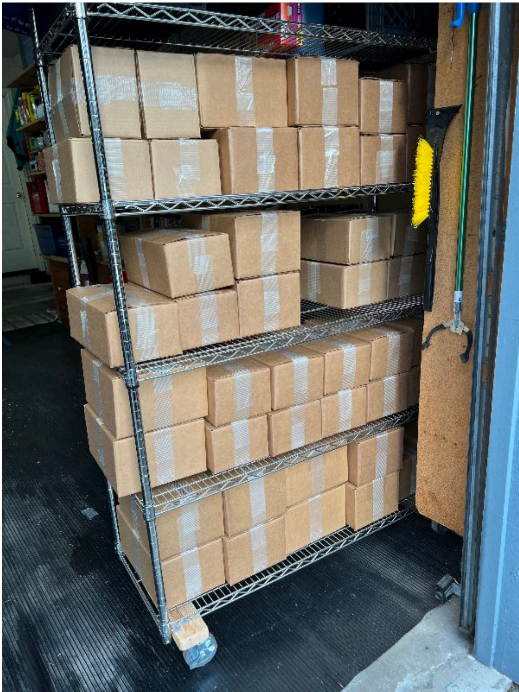
Boxes of books, all ready to ship!