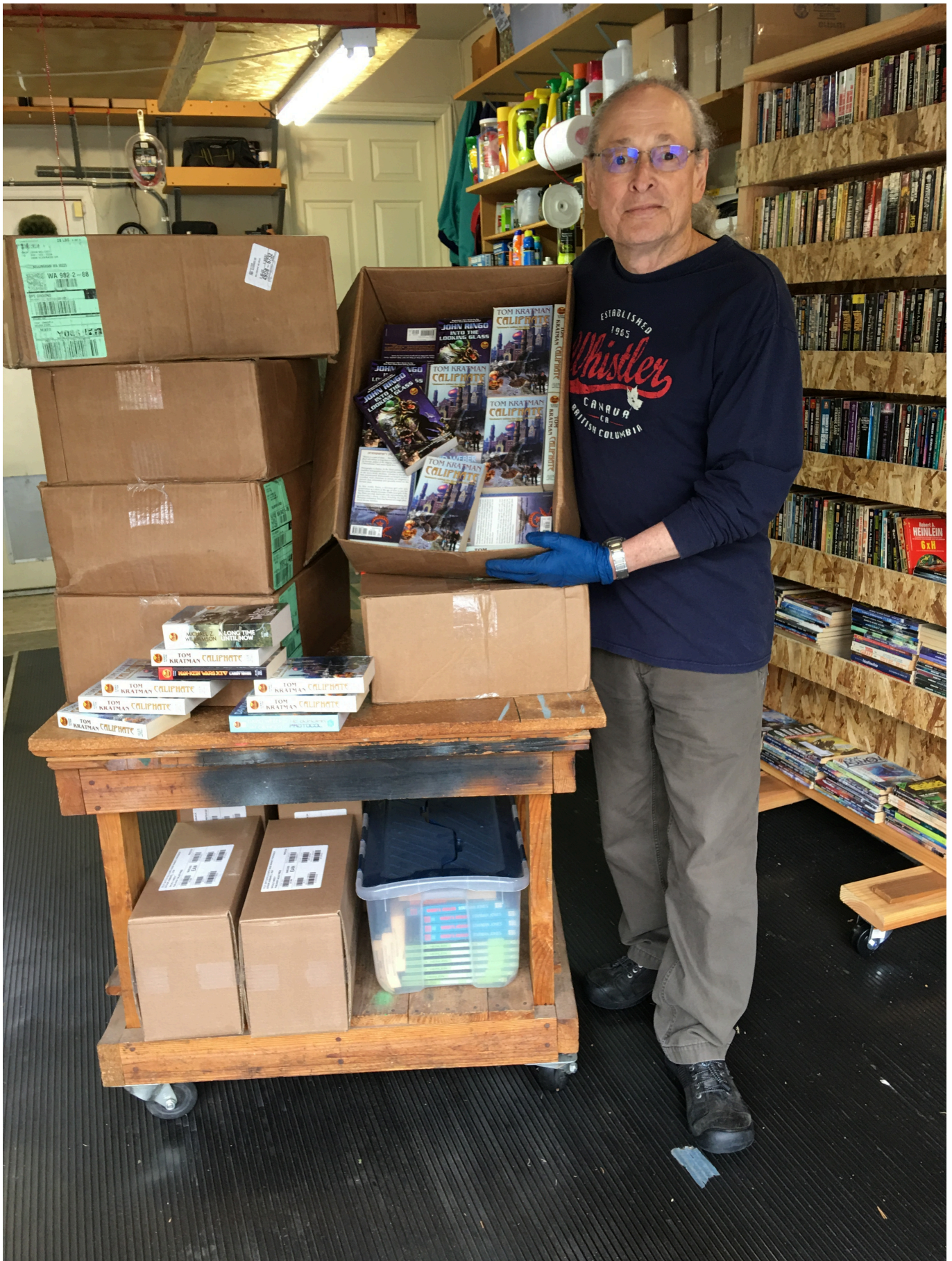
Many thanks to Baen Books for donating 260 brand new mass market paperbacks, including the latest copies of the Expanded