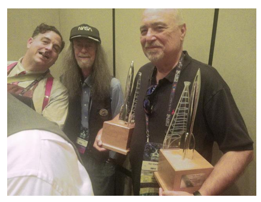
READ MORE HERE >>>