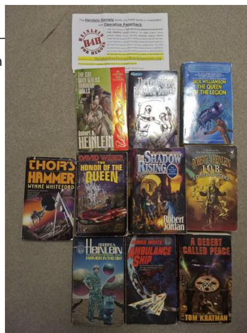
Image: recent shipment

Go to heinleinsociety.org/h4h/ for information on where to send books or money.