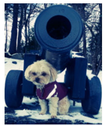
Our newsletter co-editor and his cannon, with which he plans to fight city hall.

Blood Drives Keep up with Blood Drives news at heinleinsociety.org/pay-itforward/blood-drives/