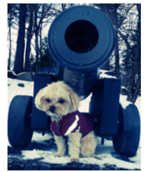
Our newsletter co-editor and his cannon, with which he plans to fight city hall.

All you will need to do is set up a recruiting table and organize other convention goers to help greet their friends at the table and ask for donations and/or recruiting by putting flyers in their booths or on their tables. I even have a scheduling tool for your friends to use to sign up to help. I will try and usually succeed in getting table space in a prime location at the con, and will supply pins, ribbons and thank you cards which can be used as a scheduling tool. Flyers are usually provided by the blood center, but if not THS can supply them. Three months is a decent lead time for scheduling with the blood center, but more is better!