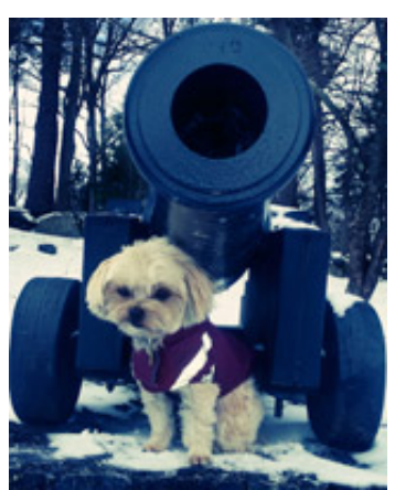
Our newsletter co-editor and his cannon, with which he plans to fight city hall.

Keep up with Blood Drives news at heinleinsociety.org/pay-itforward/blood-drives/