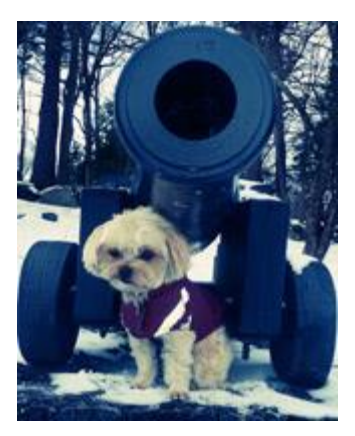
Our newsletter co-editor and his cannon, with which he plans to fight city hall.

heinleinsociety.org/pay-itforward/blood-drives/