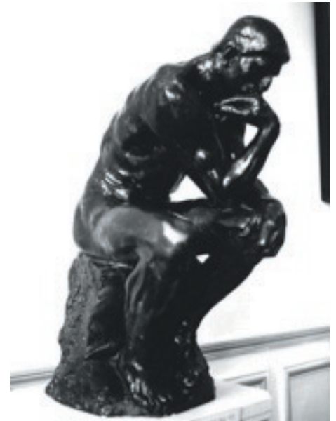
Thinking about: "... expressing the spirit, ideas, and philosophy of Robert Heinlein."

We're, perhaps, going to ask the authors of entries to assign their first North Ameri-